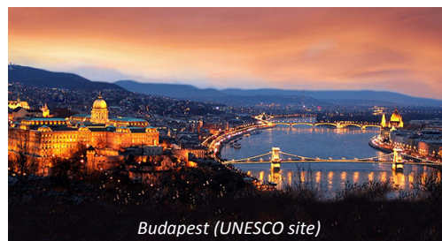
Budapest (UNESCO site)

We visit hte most important monuments, then our tour continues towards Kőszeg , a historic fortress at the Austrian border. Visit of the city center (the Church of Heart of Jesus with amazing facade, and the fortress of the fifteenth century), then we continue to Sopron , the "Civitas fidelissima", ("Most Loyal City") with a gothic pulley-shaped downtown, situatedon the rests of the Amber Road. Walking tour, then continue to Vienna, arrival to the Wien Bahnhof, and departure *.