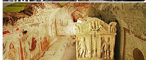
Pécs, paleochristian crypts (UNESCO site)