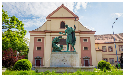
St. Martin's well, Szombathely